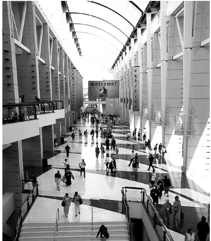
McCormick Place Convention Center