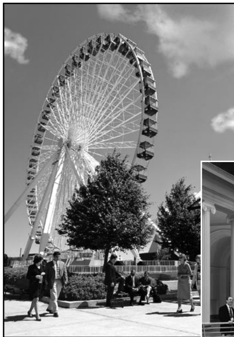
Ferris Wheel at Navy Pier