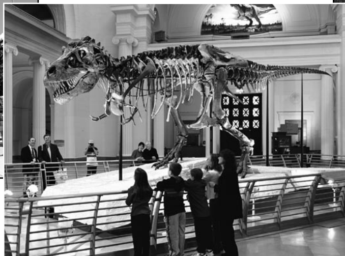
"Sue," the Tyrannosaurus Rex at the Field Museum